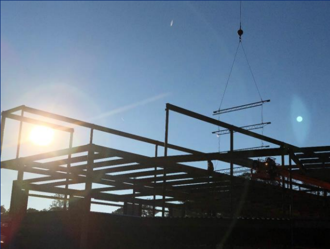
Third level roof bar joists going in