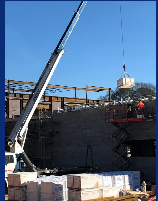
Lower level roofing material being delivered