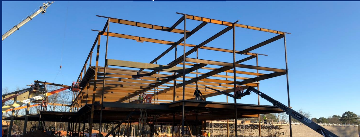
Photo of the project site from west looking at 3 rd level steel topping out