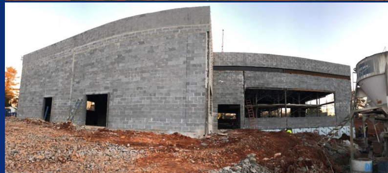
West and South lower level CMU walls topped out